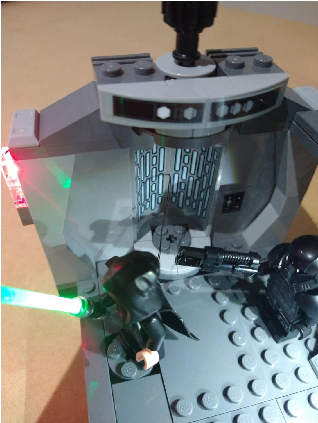
Replace Luke's lightsaber. I have run the cable through the gap of the spinning door but you can choose another way if you want to allow the door to be able to fully spin.