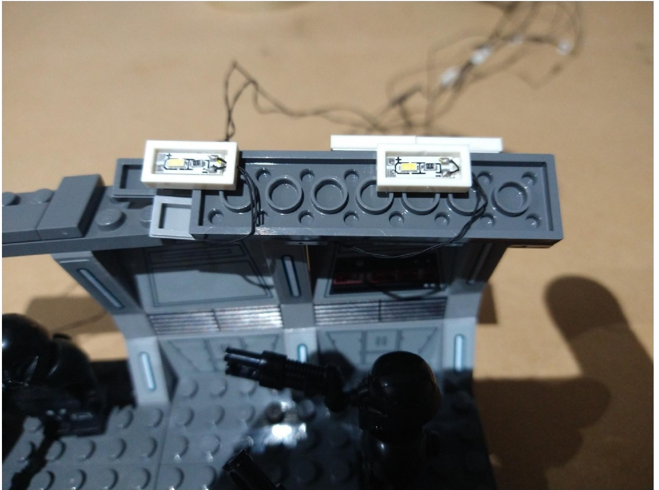
The picture shows where the 1x2 plates are placed which will allow the wires to be run out the back.